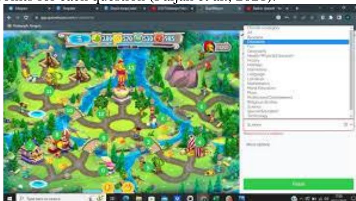
Figure 1.1 QuizWhizzer Media Display

Quizwhizzer media is an interesting, interactive learning media that prioritises collaboration and communication to facilitate positive interactions between students through games in the classroom learning process (Susanto & Ismaya, 2022). Besides being fun, this media can also help teachers make lessons more interesting and less boring (Faijah et al., 2022). More than that, this media can also increase students' motivation and enthusiasm for learning in answering questions given by the teacher (Meileni et al., 2021). Through quizwhizzer media, teachers can provide several questions to students in the form of competitions by following a certain flow arranged to resemble a snakes and ladders game system. In this media, the teacher can set and adjust what types of questions will be asked to students. In addition, this media can give points for each question, can regulate the movement and position of players on the game board, and can give points for each question (Faijah et al., 2021).