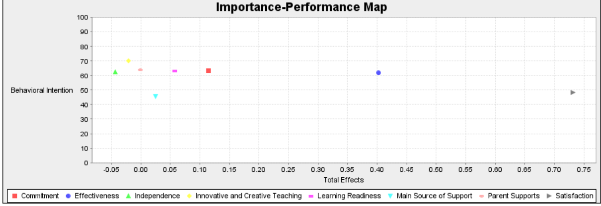
Figure 3. IPMA Behavioral Intention (Standardized Effect)

IPMA is to identify the factor that has significant importance for the particular target construct development, with the comparison of low performance (Martilla & James, 1977). We feel it is necessary to present the most influential factors, considering that this research was conducted during the Covid-19 pandemic. Figures 2 and 3 respectively show IPMA for Satisfaction and Behavior Intention.